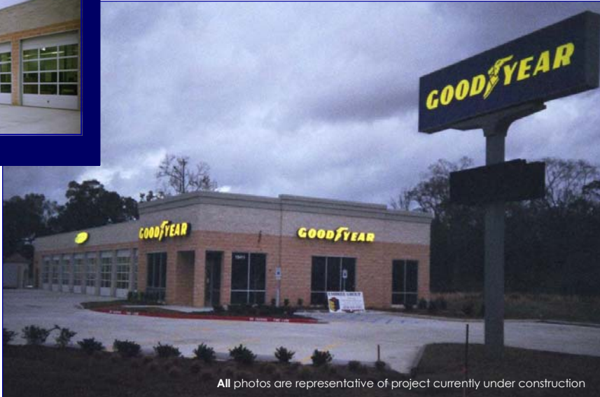
All photos are representative of project currently under construction