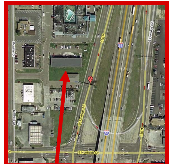
Safelite Investment Location