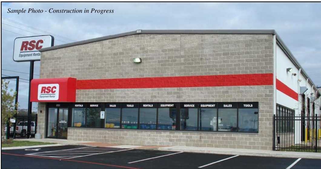
Sample Photo - Construction in Progress

RSC Equipment Rental serves as a vital and trusted partner for thousands of customers in construction, industrial, petrochemical, governmental, and manufacturing businesses across the United States, Canada and Mexico. By providing timely rentals, maintenance, service, and sales of new and used equipment, tools, and parts, RSC (Rental Services Corporation) helps our customers to do their jobs more efficiently and more profitably.