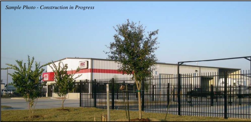
Sample Photo - Construction in Progress

RSC Equipment Rental serves as a vital and trusted partner for thousands of customers in construction, industrial, petrochemical, governmental, and manufacturing businesses across the United States, Canada and Mexico. By providing timely rentals, maintenance, service, and sales of new and used equipment, tools, and parts, RSC (Rental Services Corporation) helps our customers to do their jobs more efficiently and more profitably.