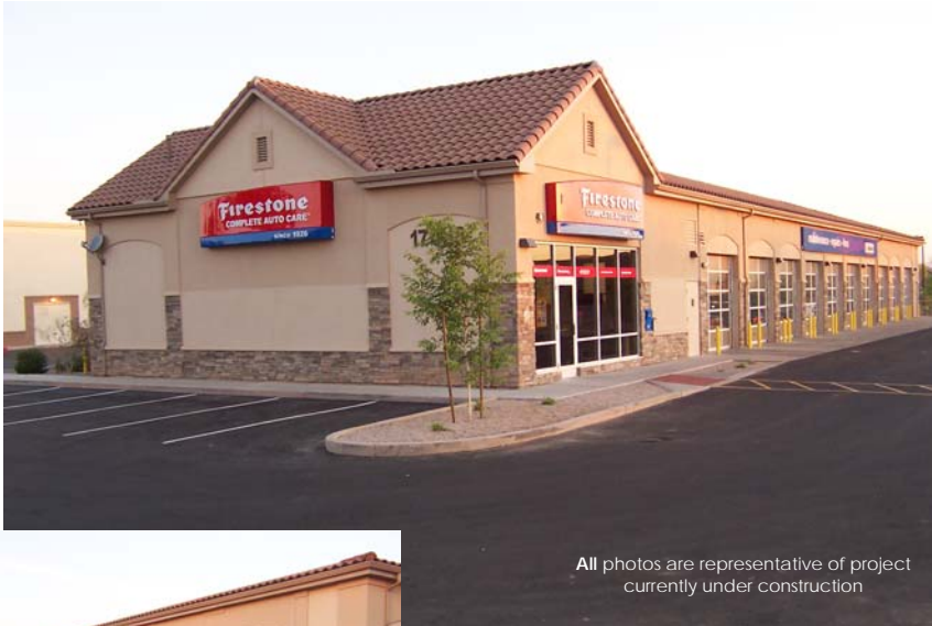
All photos are representative of project currently under construction

FIRESTONE AUTO CARE CENTER 5125 W. Southern • Laveen, AZ